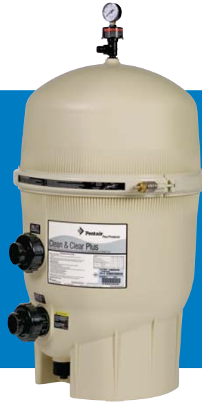
Clean & Clear® Plus Filters

Water flows very efficiently through the Clean & Clear® Plus filters, often allowing the use of smaller pumps or lower pump speeds to minimize energy use. And when you rinse cartridges rather than backwash, you can significantly reduce water use, too.