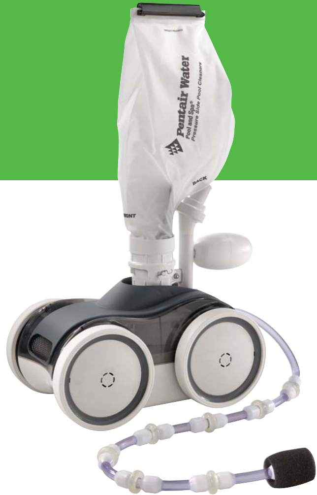
Legend® II Automatic Pool Cleaner