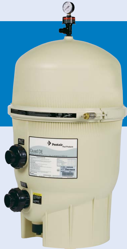
Quad D.E. ® Filter