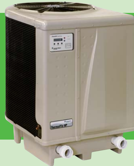
ThermalFlo™ Heat Pumps

When a heat pump is appropriate for your climate, it is the most energy-efficient heating option. ThermalFlo™ heat pumps transfer heat from the atmosphere to the pool or spa, saving up to 80% in energy costs compared to gas-fired heaters. Plus, they are the only heat pumps available that use R-410A refrigerant—EPA-recognized as environmentally safe and clean.