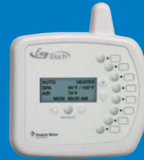
EasyTouch® Automated Controls