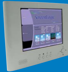
IntelliTouch® Automated Controls

Pentair control systems can optimize energy use and equipment performance by automating and synchronizing equipment scheduling. They prevent problems and waste so you don't have to rely on your memory or limited time clocks to operate or turn off equipment.