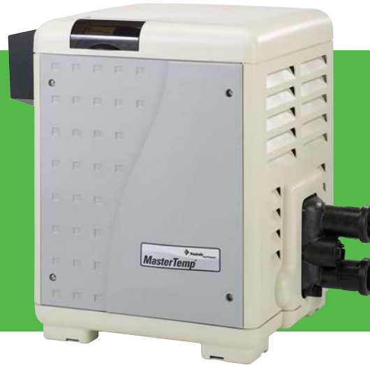
MasterTemp® High Performance Heaters

MasterTemp® high performance heaters offer best-in-class energy efficiency. Plus, they are certified for low NOx emissions, making them eco-friendly favorites.