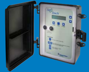
SunTouch™ Automated Controls