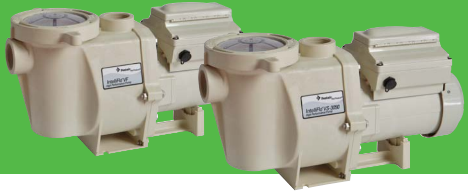
IntelliFlo® VF Variable Drive Pump

Standard pool pumps can consume as much energy as all other home appliances combined—often costing more than $1,000 per year! IntelliFlo® pumps can typically cut energy use by 30% to 90%, generally saving $324 to $1,356 in utility costs annually—more where rates are higher than average.*