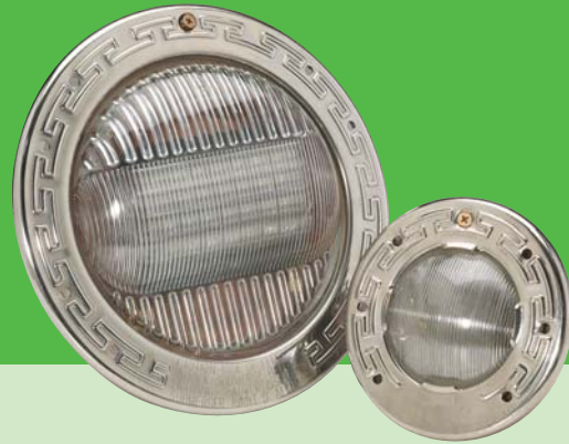
IntelliBrite® LED Color-Changing Lights

IntelliBrite® LED (Light Emitting Diode) color-changing pool and spa lights are the most energy-efficient color-changing pool and spa lighting option available. Plus, they can last 30,000 hours or more, minimizing replacement cost and disposal.